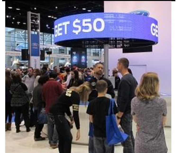
Sign Up Booth for $50 Visa Card Dealer Test Drive Promotion At The 2017 Chicago Auto Show